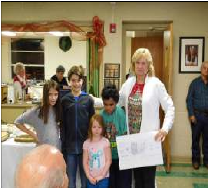
The offering from the Children's Sunday school was donated to PALS and given at the Christmas dinner. The Pals representative above is receiving the enlarged check in the amount of $145.85.

Courses for the laity will be available soon at BKSM.